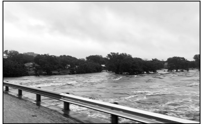
FLASH FLOOD IN KERR COUNTY